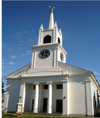
First Congregational Church of Rowley, MA

Today we celebrate the rich history of both our church and our town. First Congregational Church of Rowley and the Town of Rowley can trace their founding back to the Act of Incorporation established on December 4, 1639, naming Ezekiel Rogers' Plantation as Rowley. Thus, today being December 5th, it is the closest Sunday to the actual incorporation date.