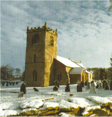
Mother Church: St. Peter's Anglican Church, Rowley, England